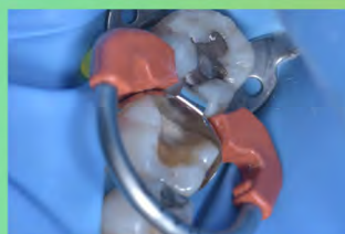
Halo™ matrix showing good adaptation to tooth margin